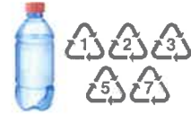
PLASTICS Label #s 1, 2, 3, 5 & 7