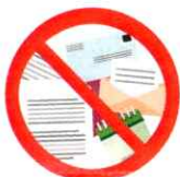
Mixed Paper (Newspapers, magazines, junk mail, computer paper, telephone books)