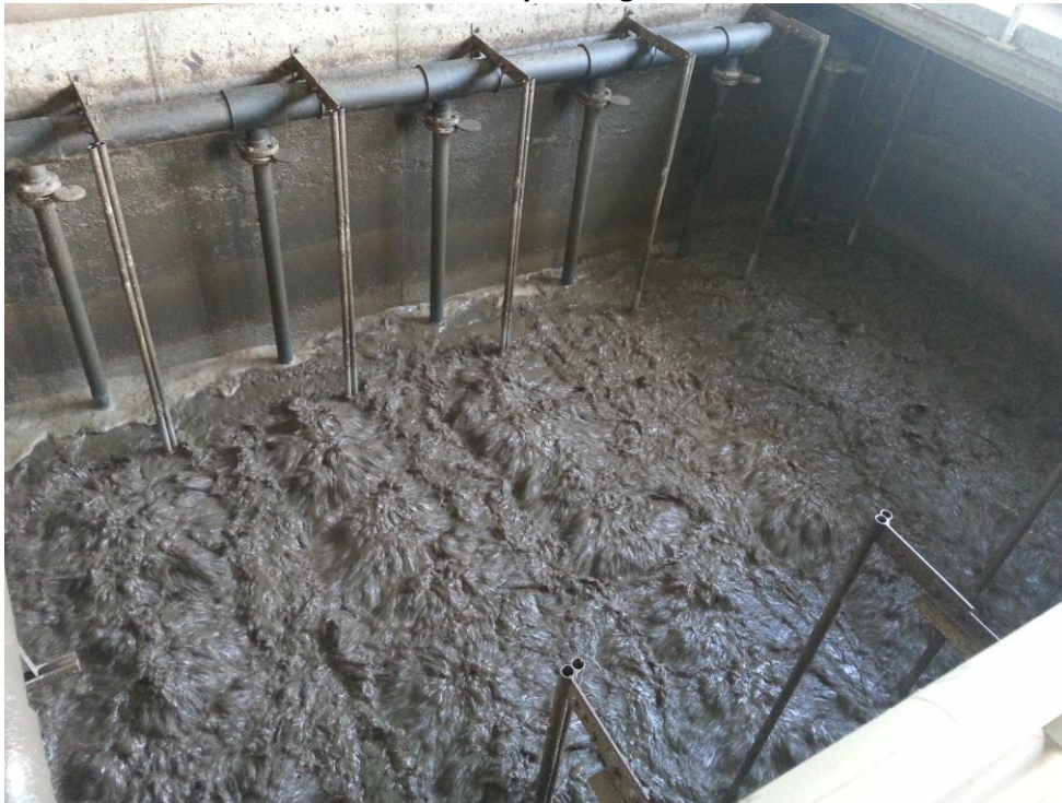
This is MBR Basin #3 when it was still operating

In the Wastewater Treatment Department, the crew is removing the old membranes from basins three and four so that they can be cleaned, equipment repaired and new membranes installed. Once that process is complete the plant will operate more efficiently. We are only replacing the membranes in two of the four tanks and those membranes cost just under $200,000.00. I have included a few pictures to help everyone better understand.