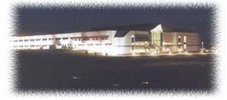
Troy Buchanan High School

1999 Median Income State of Missouri: $37,934 Lincoln County: $42,592 Troy: $40,332 Winfield: $36,167 Moscow Mills: $37,067 Hawk Point: $29,286 Elsberry: $27,917 Silex: $24,531