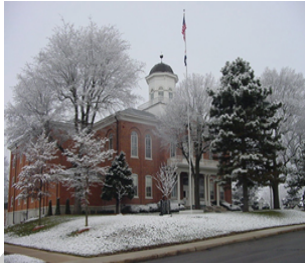
The Lincoln County Courthouse located on Main Street in Troy.