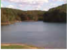
Lake Lincoln, Cuivre River State Park

Cuivre River State Park is located in Lincoln County. Encompassing over 6,400 acres of hills creeks, woods and grasslands the park is located in northern Missouri's Lincoln Hills. More than 650 native plant species and over 150 bird species make their home at Cuivre River State Park. The park also features camping facilities, horseback riding trails, walking trails, two state park wilderness areas and much more.