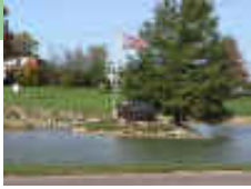
Troy Fairgrounds Park