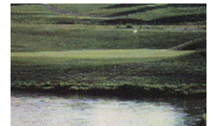
Woods Fort Golf Course, Troy